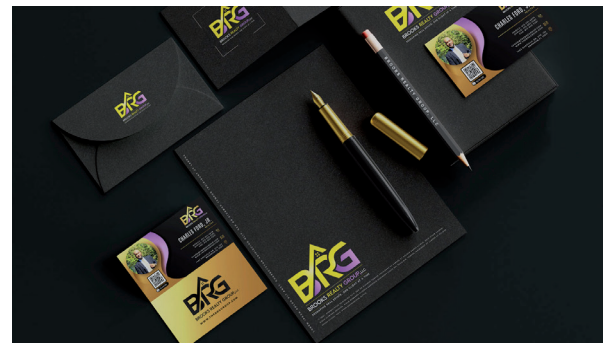
The Brooks Realty Group