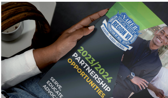
The National Association of Real Estate Brokers