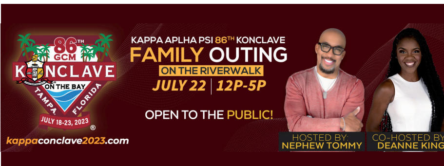
Kappa Alpha Psi General Chapter Meeting