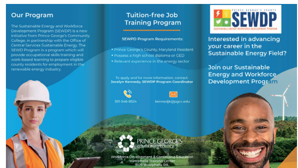
Prince George's Community College