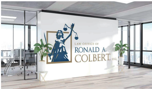
Law Office of Ronald A. Colbert